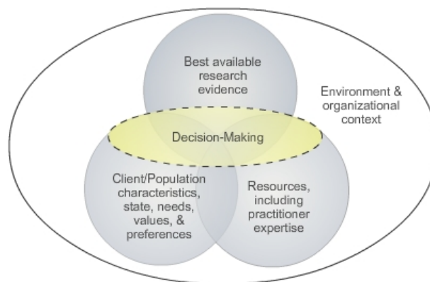
Three Circles Model of EBBP

EBBP entails making decisions about how to promote healthful behaviors by integrating the best available evidence with practitioner expertise and other resources, and considers the characteristics, state, needs, values and preferences of those who will be affected. This is done in a manner that is compatible with the environmental and organizational context. The figure below shows the Three Circles Model of EBBP (Satterfield et al., 2009; Spring & Neville, 2009).